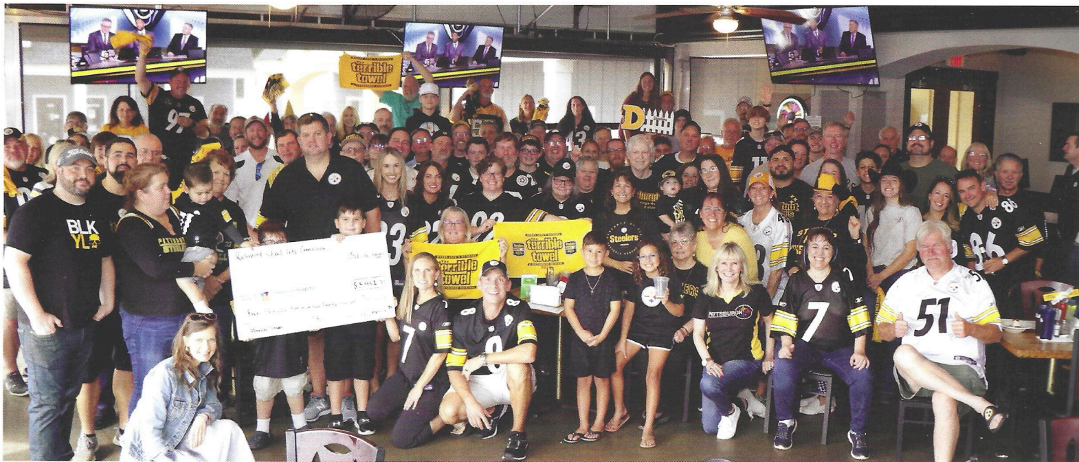
Members of Richmond's Steel City Connection, a local group of Pittsburgh Steelers fans, raised $5,441 this year toward their commitment to name a unit secretary station in the Children's Tower.