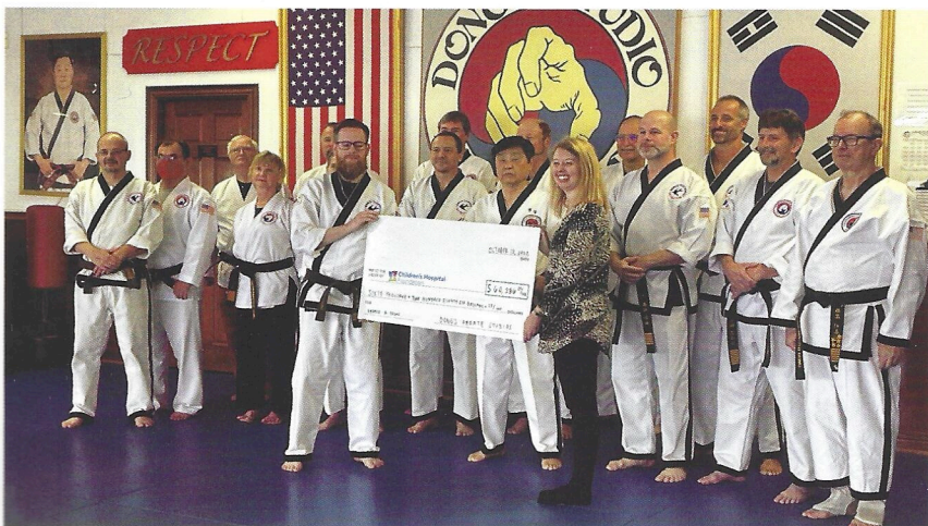
This year's "Karate-a-thon" hosted by Grandmaster Dong's Martial Arts raised $90,286. The annual event encourages students and their families from all eight Grandmaster Dong's locations to challenge themselves through martial arts. Since 1996, the event has collected more than $767,000 for CHoR.